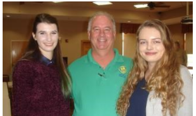
A visit to the Overbrook Club to promote Youth Exchange.